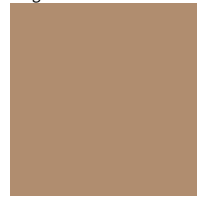
Beige - BEI