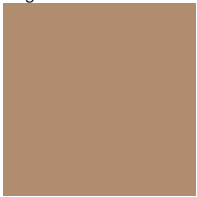
Beige - BEI